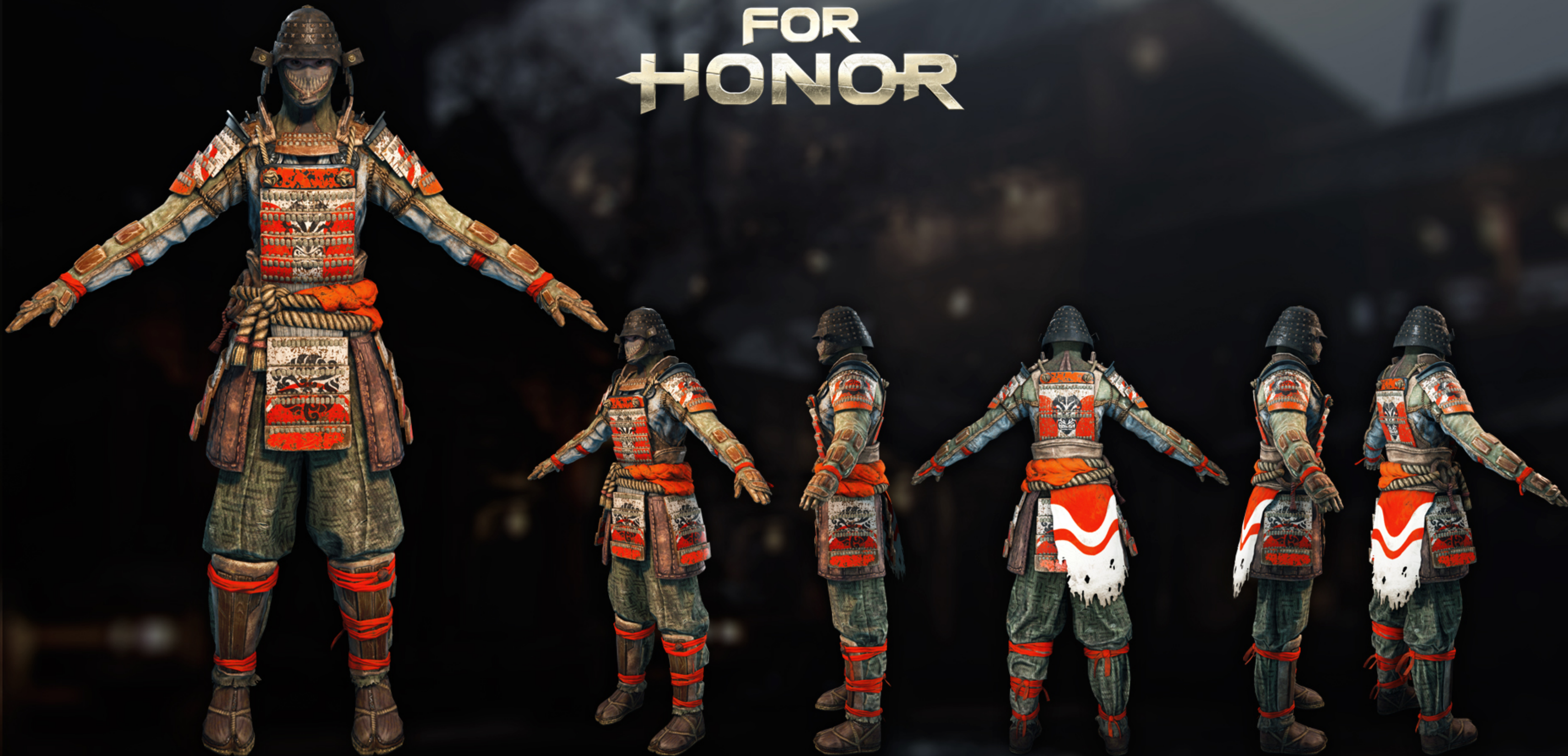
OROCHI - 360° VIEW (FEMALE)