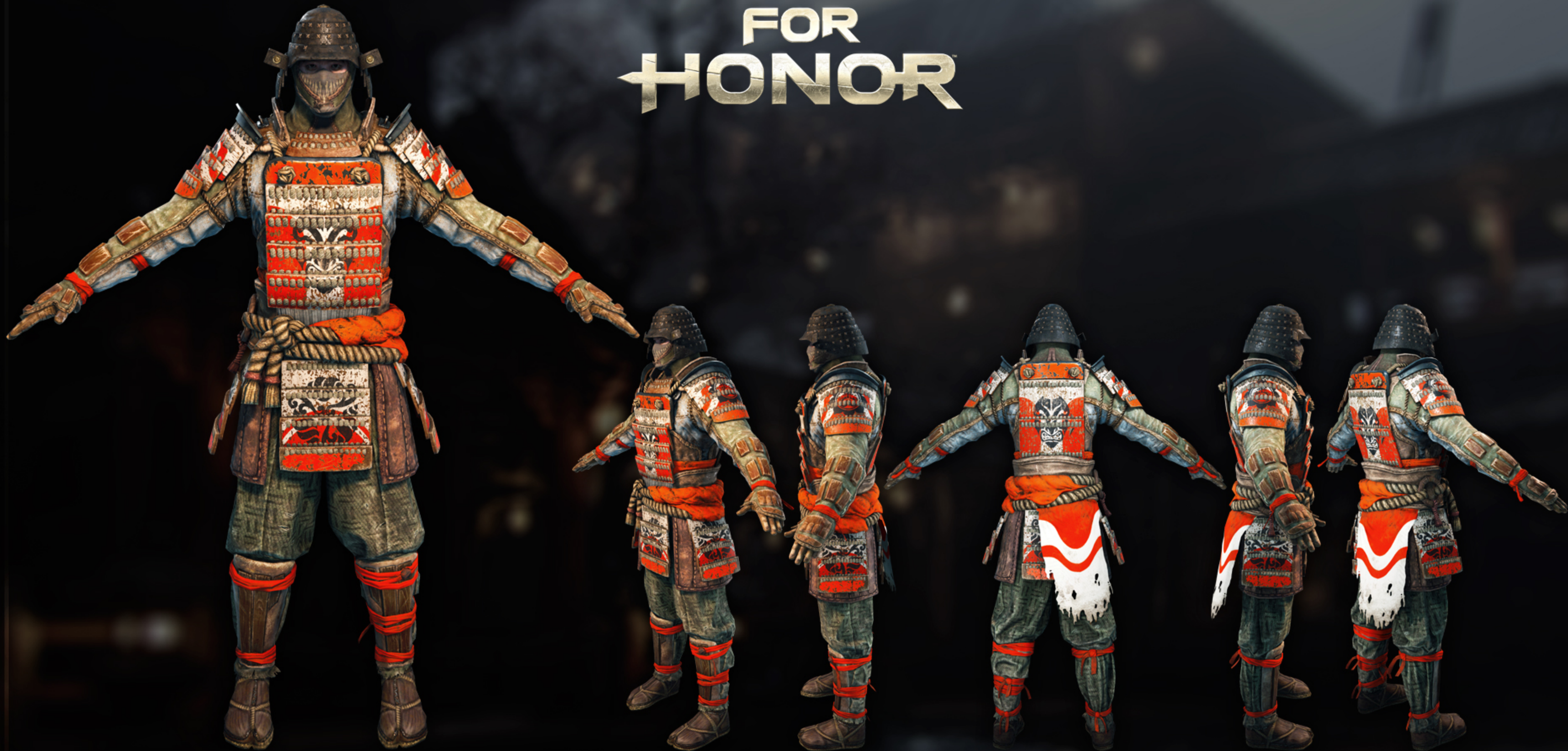
OROCHI - 360° VIEW (MALE)